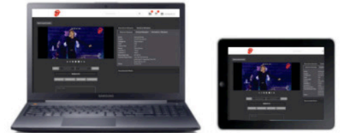
Cubix White Labelled web clients